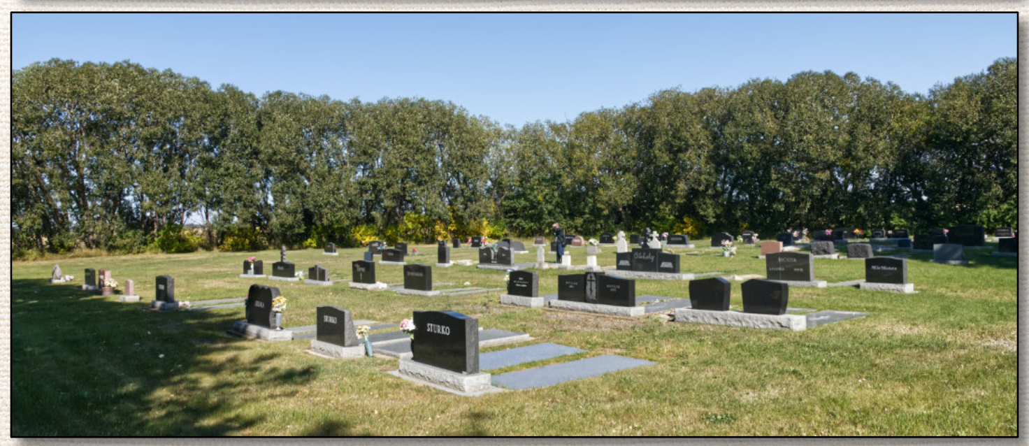
Calmar | Ukrainian Orthodox Churches in Alberta | Page 3