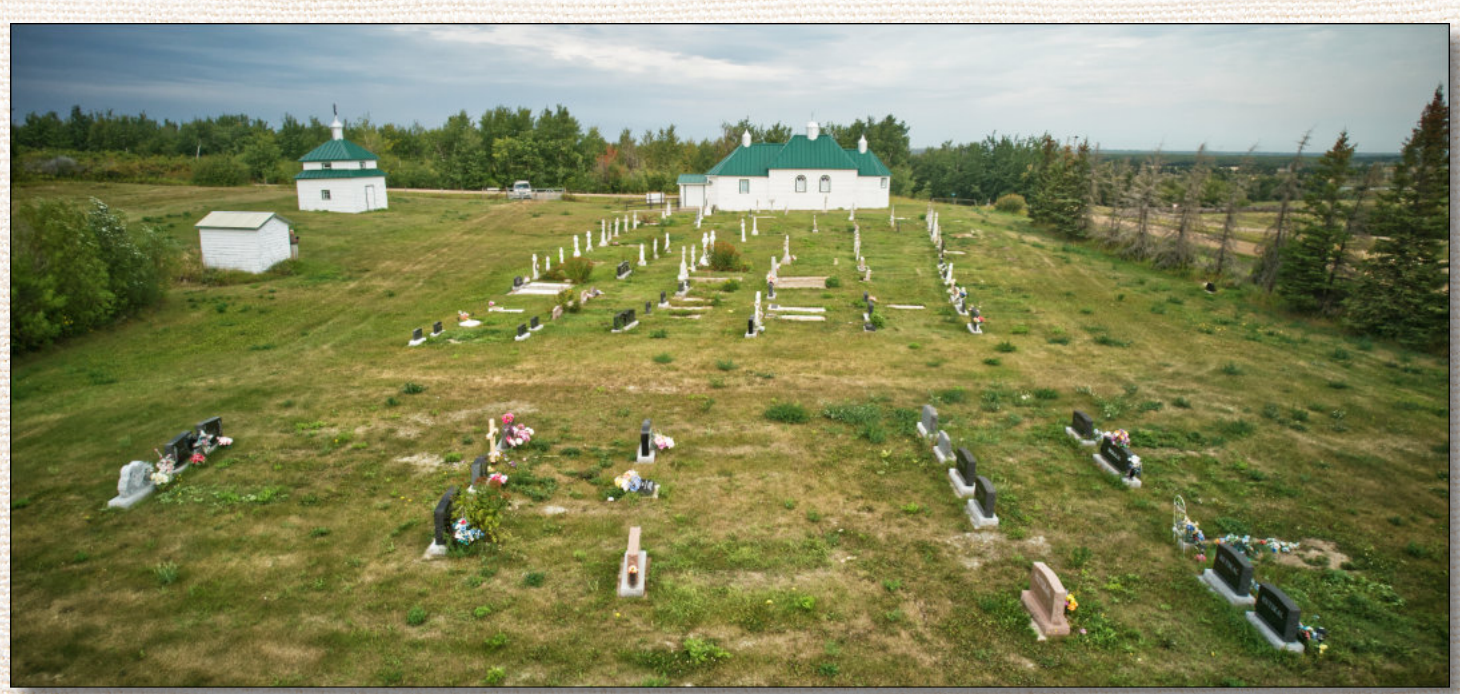
Ispas | Ukrainian Orthodox Churches in Alberta | Page 3