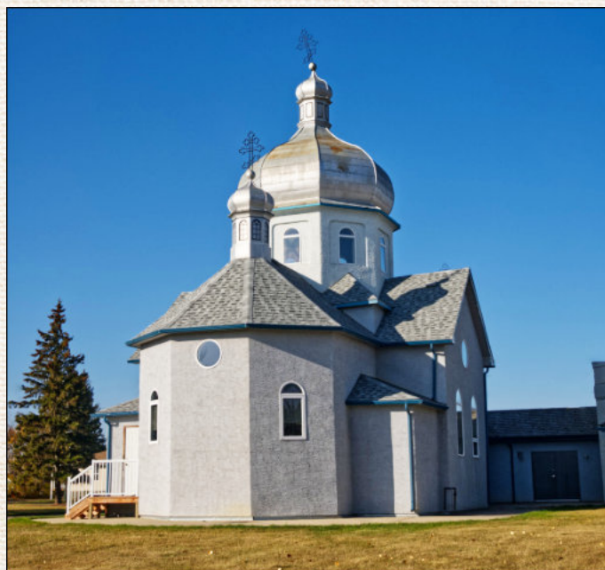
The former Holy Spirit Church from Willingdon is now All Saints in St. Paul, Alberta.