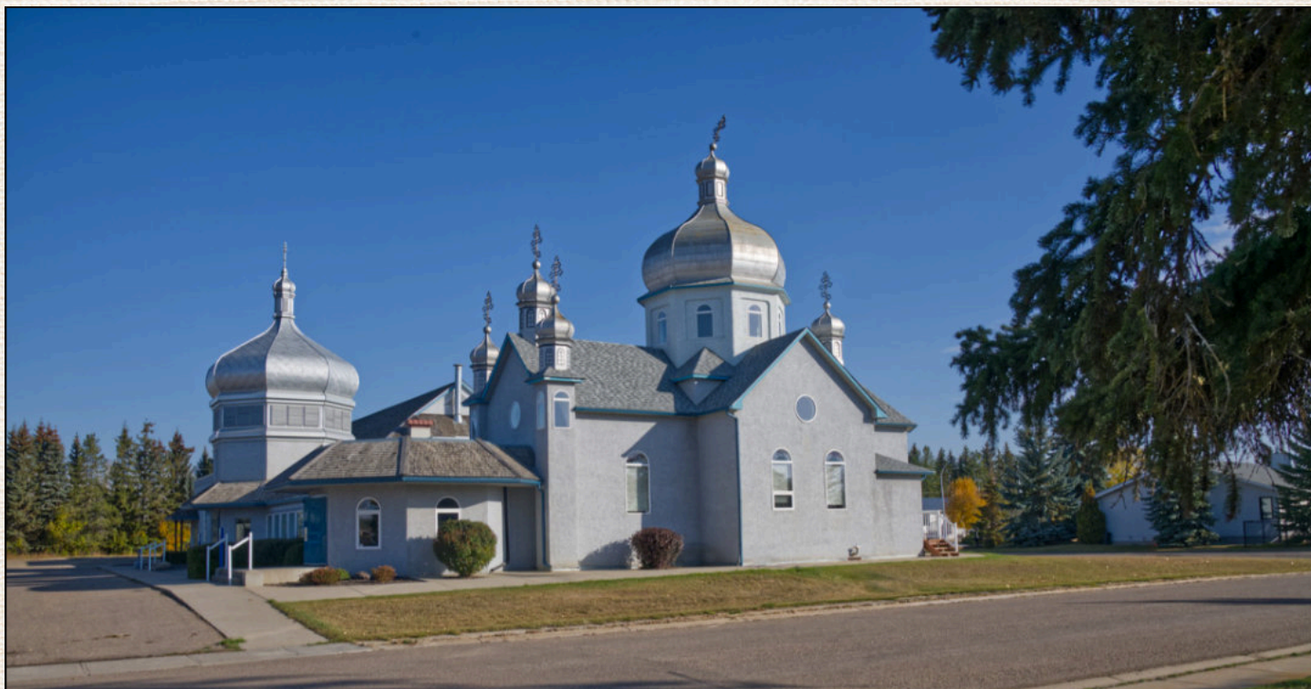
The original Holy Spirit church at its current location in St. Paul.